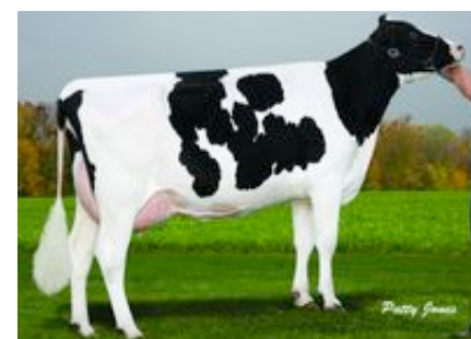
Shylane Samuele Honour 2008