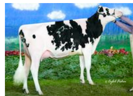
Lareleve Samuele Chrissy 2008